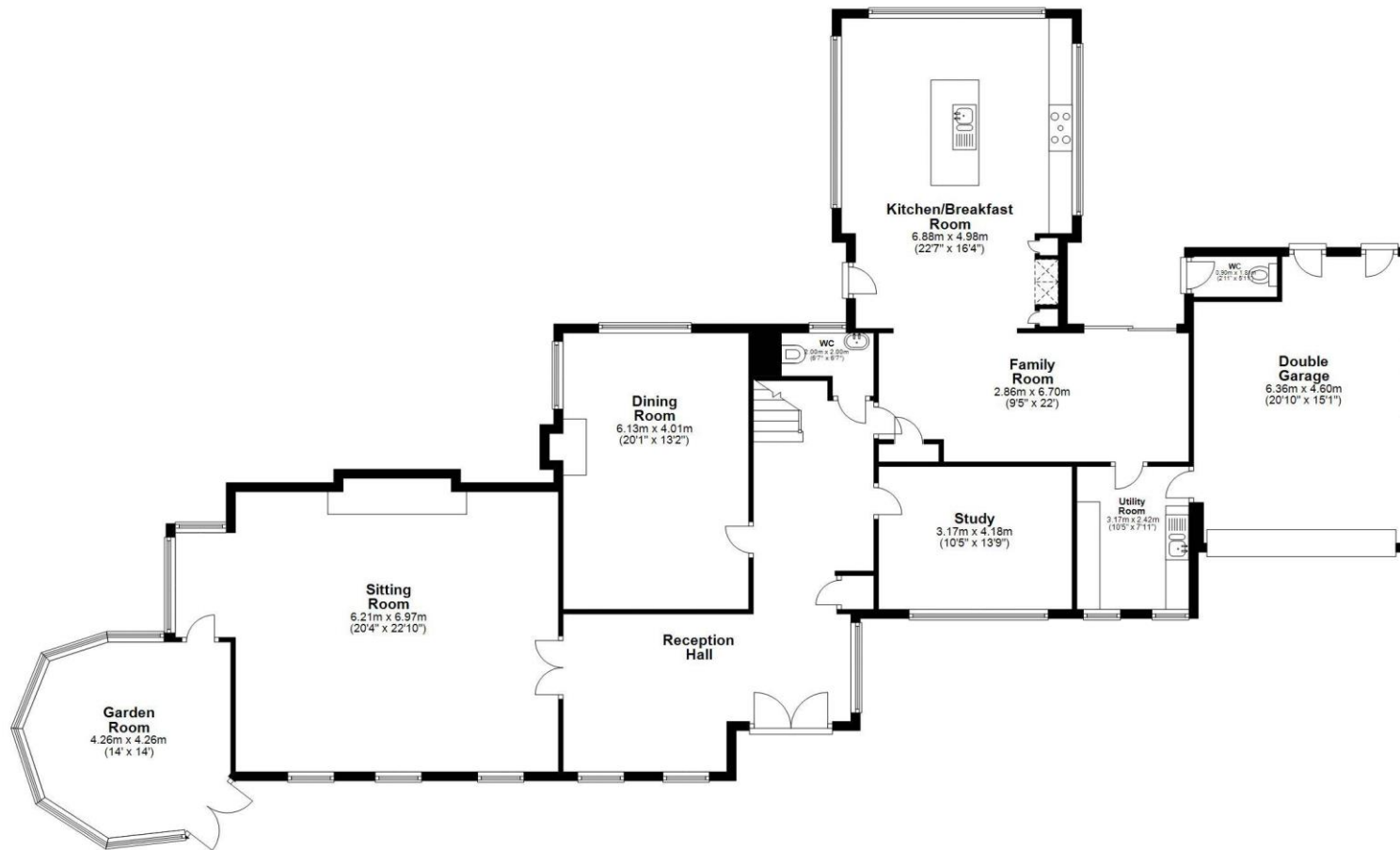
Ground Floor Approx. 229.3 sq. metres (2468.7 sq. feet)