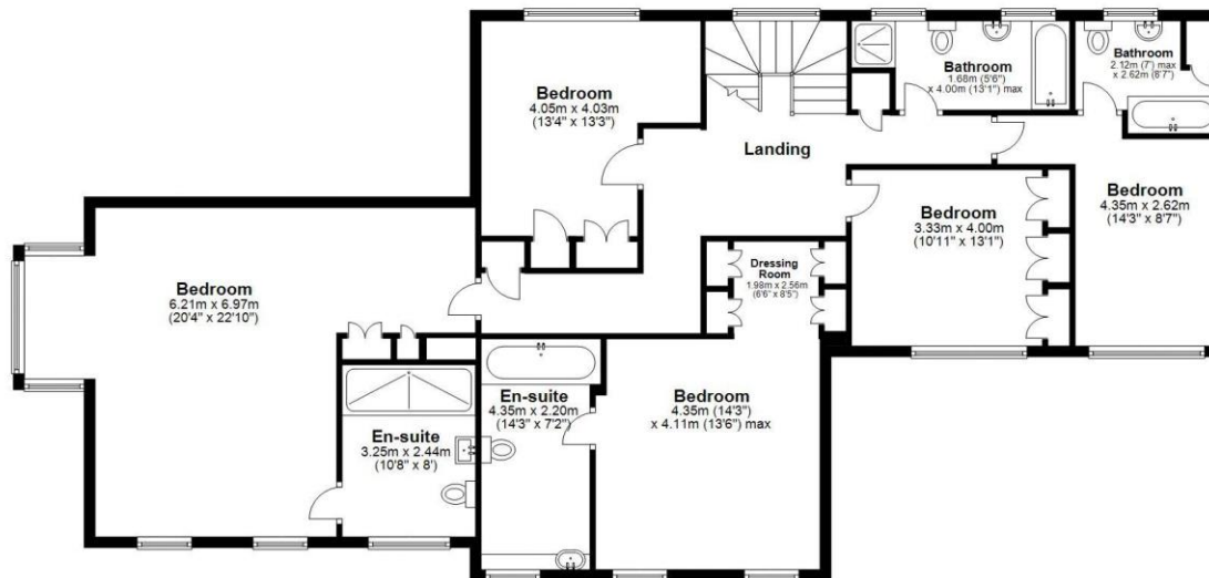
Main area: Approx. 385.2 sq. metres (4146.6 sq. feet) Plus garages: approx. 20.7 sq. metres (222.4 sq. feet)